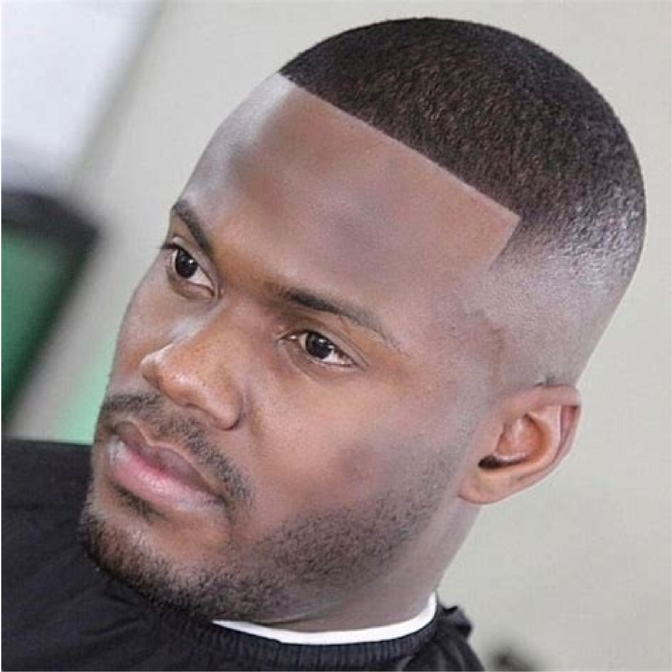
Men's haircut fade guide. Men's haircut fade marking guide.